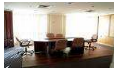
The committee table

Hire, bar & catering available all at reasonable charges.