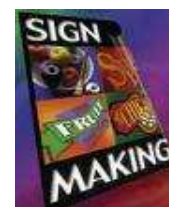
Signage to meet your own specification

- a 3 year minimum rental period is expected